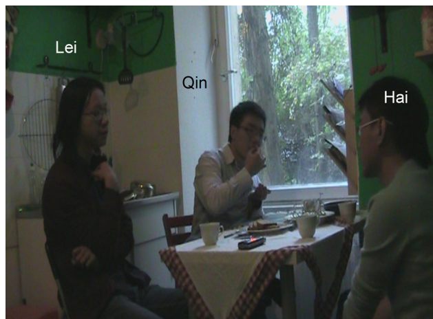
Fig. 22. Lei's body returns to home position upon the receipt of the response in line 14.

question receives no immediate uptake. Hai and Yin are still involved in the discussion on the height of the mountain (lines 11 and 12). Lei holds his leaning body position during Hai and Yin's entire discussion (Fig. 21) until his question is answered (line 13, Fig. 22), which displays their orientation to the holding of the lean as relevant to the response. Through the extended hold of his lean, Lei holds the speakers accountable for the response to his question.