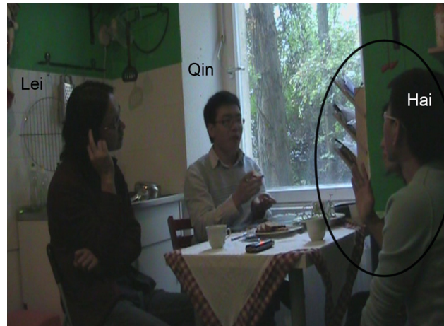
Fig. 19. Lei's body in home position before initiating his question and Hai's gaze aversion and gesture in line 08.