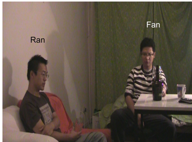
Fig. 18. Ran's body still in home position upon the receipt of the response in line 14.